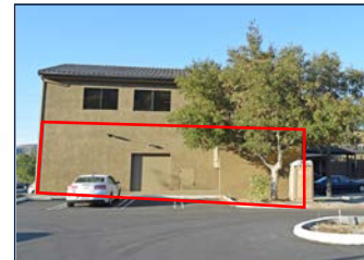
REAR ROLL-UP DOOR 28210, SUITE 100 A