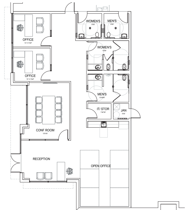
FLOOR PLAN | BLDG 7