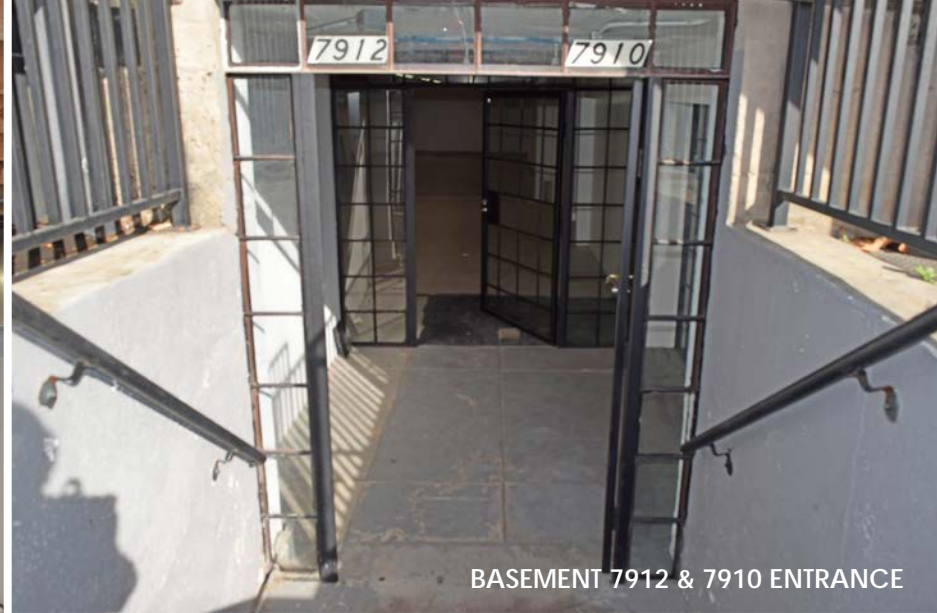
BASEMENT 7912 & 7910 ENTRANCE