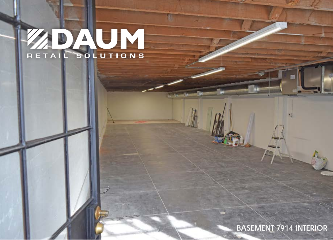
BASEMENT 7914 INTERIOR