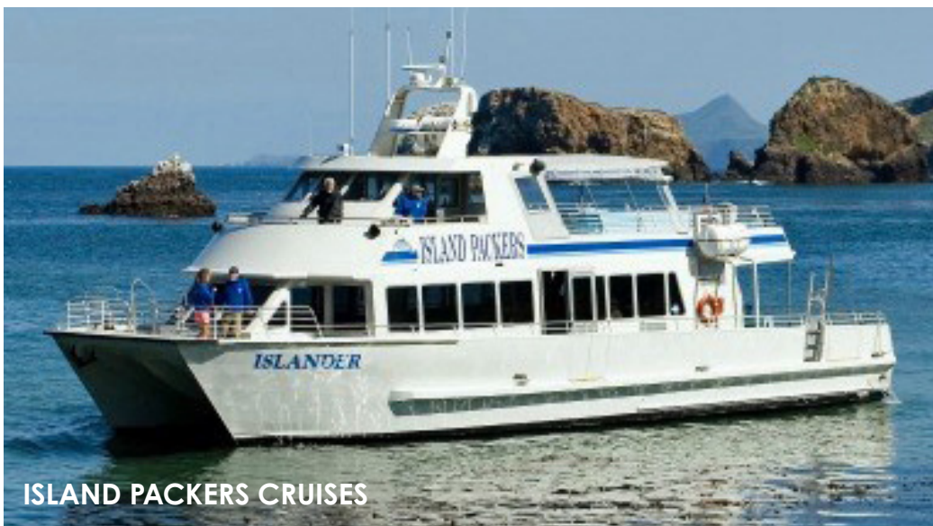
ISLAND PACKERS CRUISES