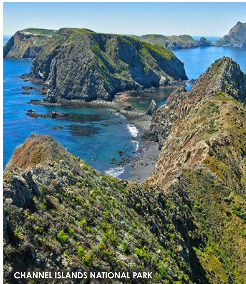
CHANNEL ISLANDS NATIONAL PARK