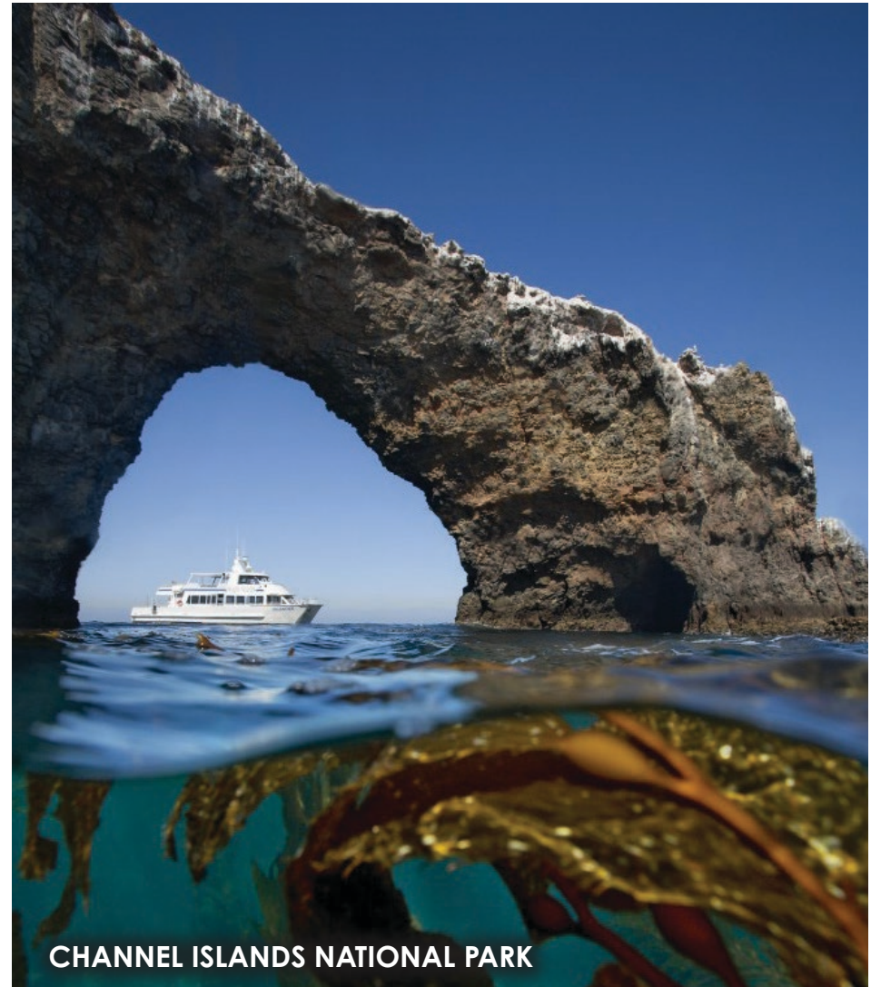
CHANNEL ISLANDS NATIONAL PARK