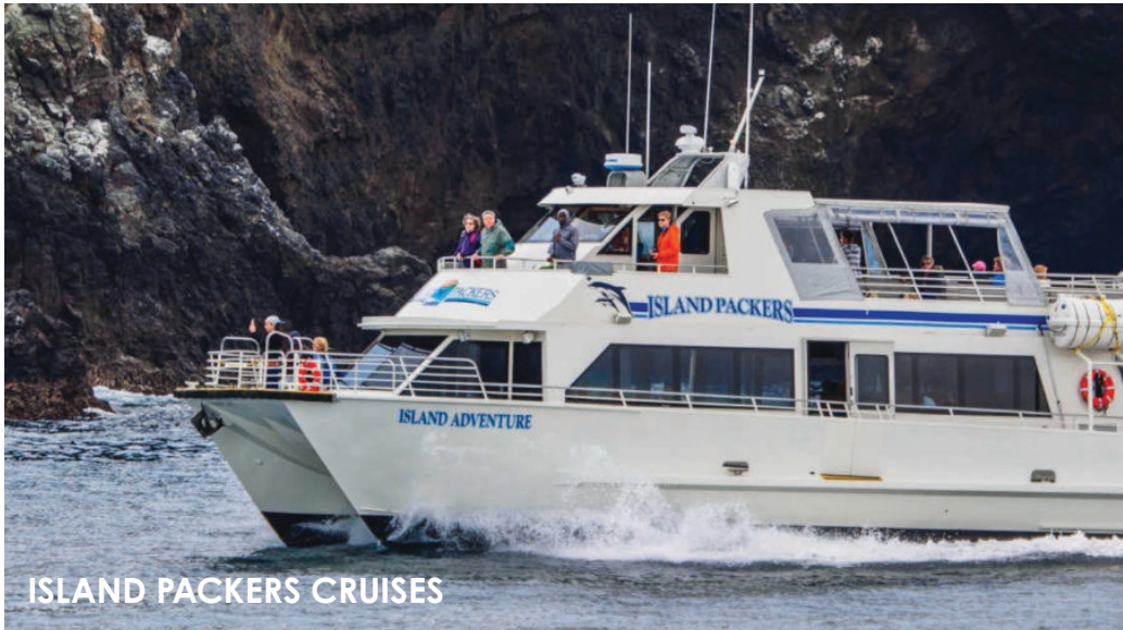
ISLAND PACKERS CRUISES