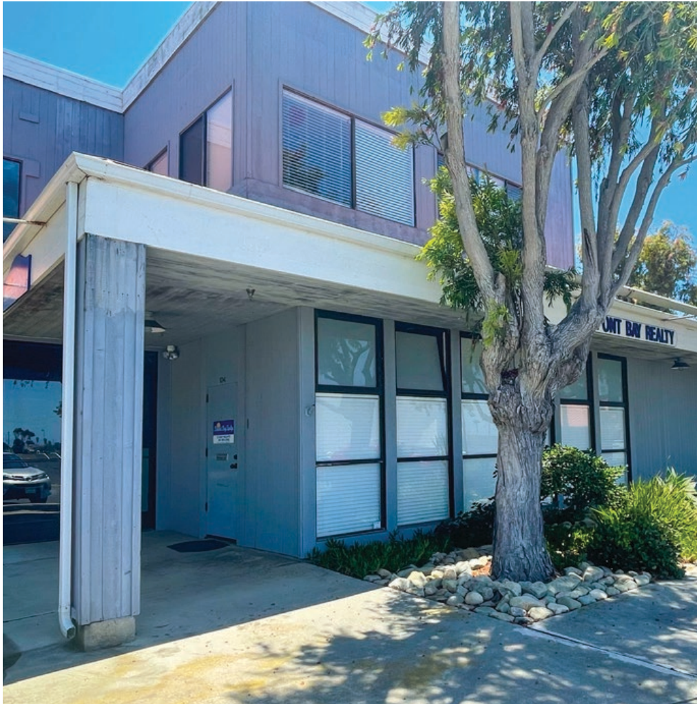
SUITE 104 | 584 SF