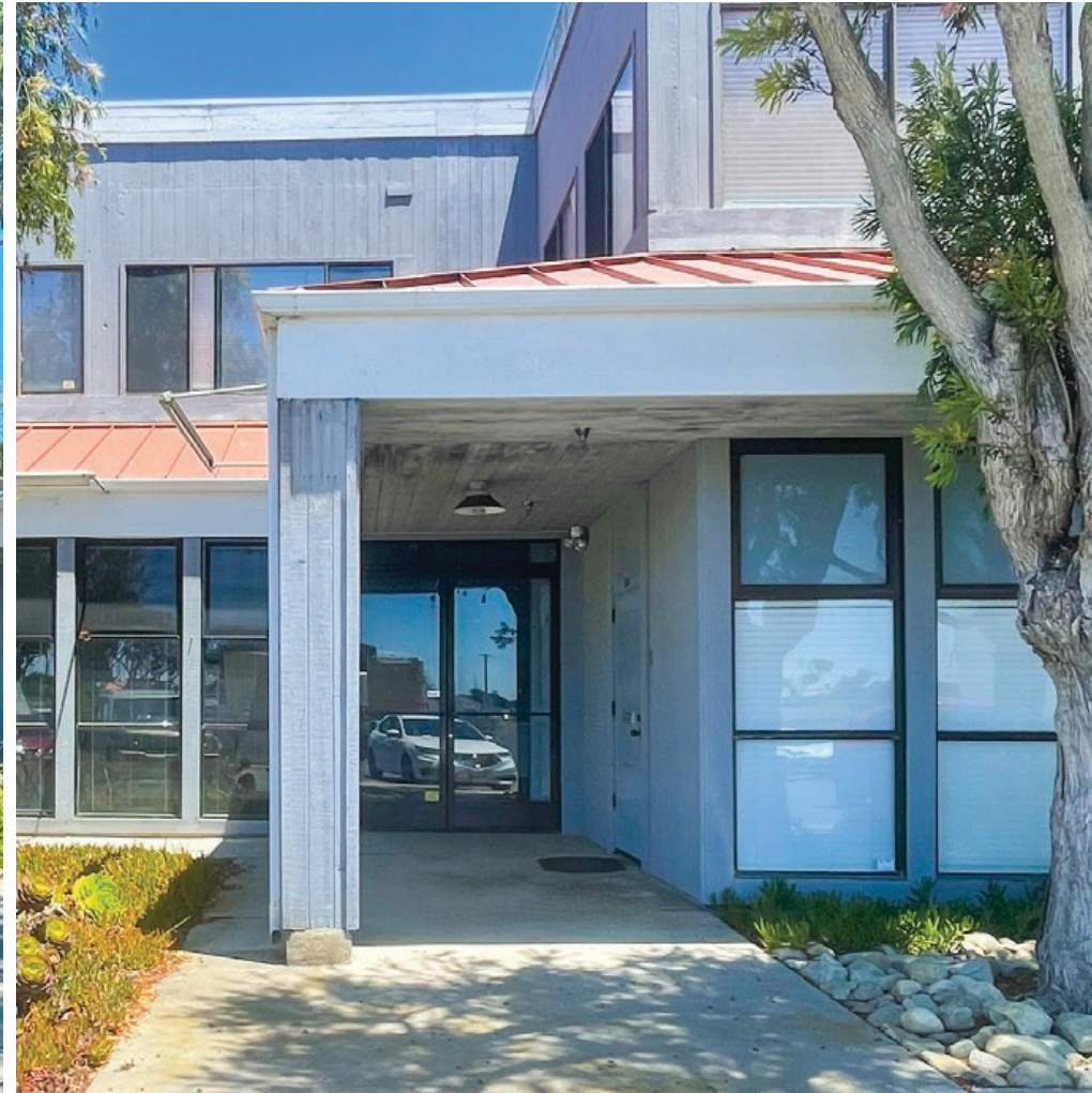
SUITE 109 | 730 SF