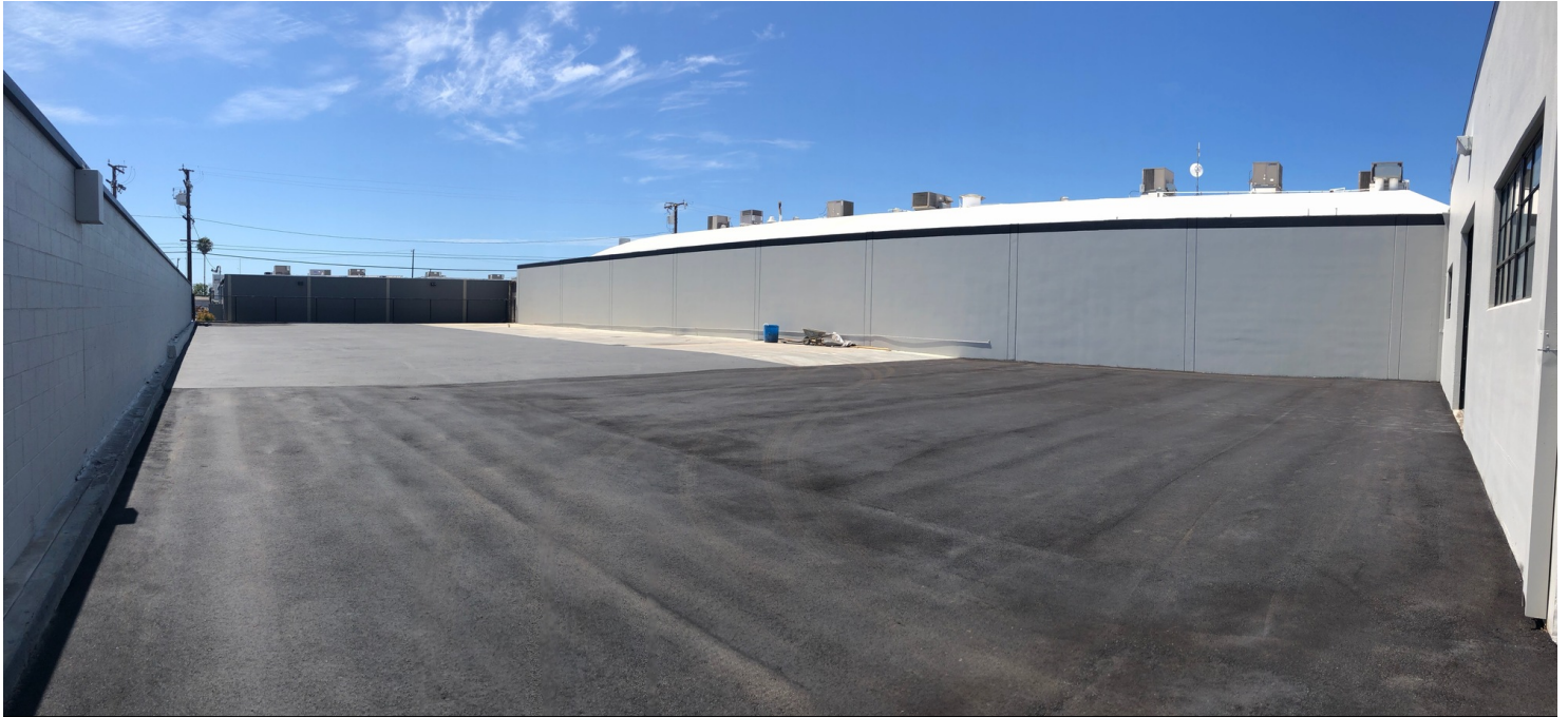
Secured Parking Area