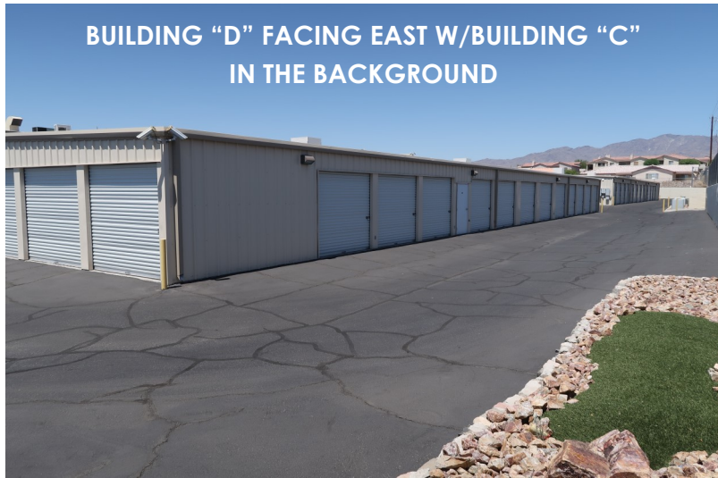
BUILDING "D" FACING EAST W/BUILDING "C" IN THE BACKGROUND