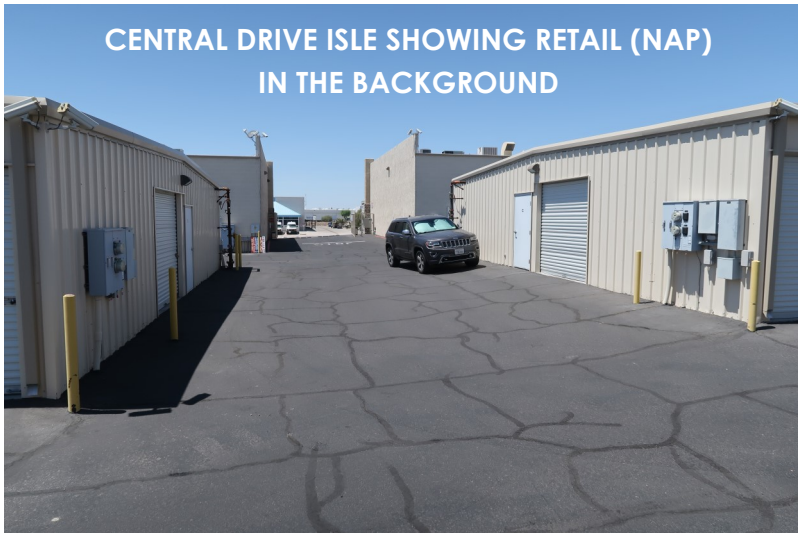
CENTRAL DRIVE ISLE SHOWING RETAIL (NAP) IN THE BACKGROUND