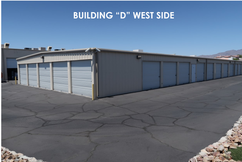
BUILDING "D" WEST SIDE