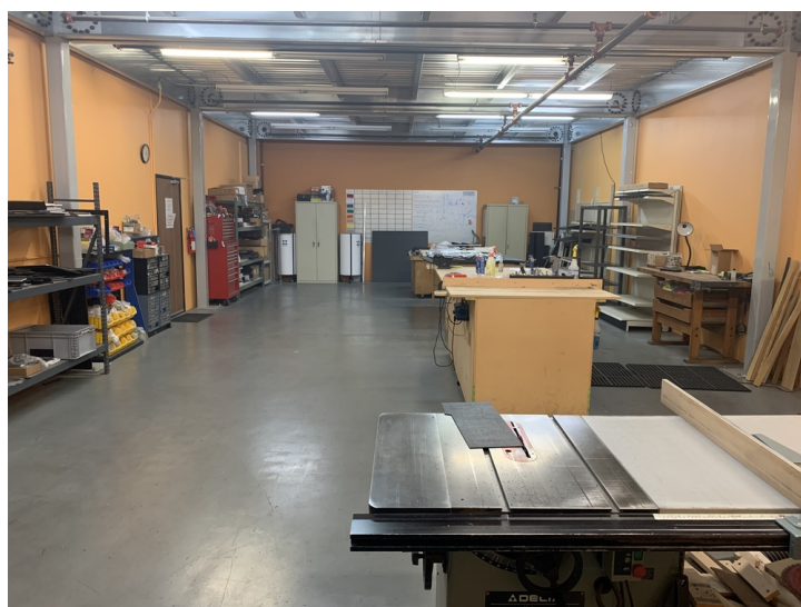
Under Mezzanine - Light Assembly/Mfg Area (1,235 SF)

Although all information is furnished regarding for sale, rental or financing is from sources deemed reliable, such information has not been verified and no express representation is made nor is any to be implied as to the accuracy thereof, and it is submitted subject to errors, omissions, changes of price, rental or other conditions, prior sale, lease or financing, or withdrawal without notice.