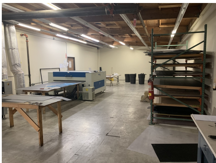
Bonus Mezzanine (1,235 SF)