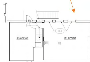
2 nd Floor Office

Although all information is furnished regarding for sale, rental or financing is from sources deemed reliable, such information has not been verified and no express representation is made nor is any to be implied as to the accuracy thereof, and it is submitted subject to errors, omissions, changes of price, rental or other conditions, prior sale, lease or financing, or withdrawal without notice.