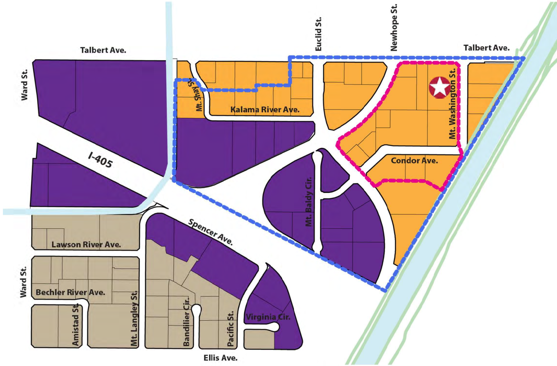
FIG.2.1 DISTRICTS MAP

FOR LEASE 11240-11230 TALBERT AVE. FOUNTAIN VALLEY, CA