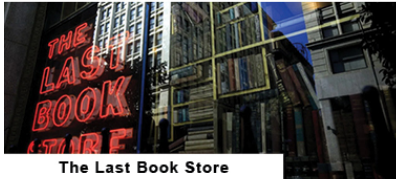
The Last Book Store