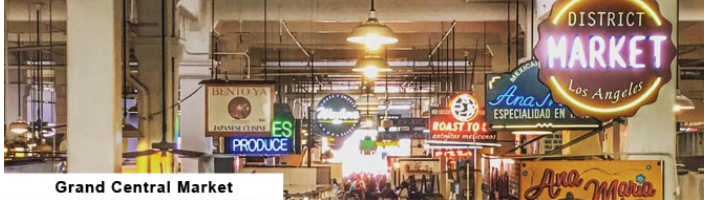
Grand Central Market