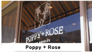
Poppy + Rose