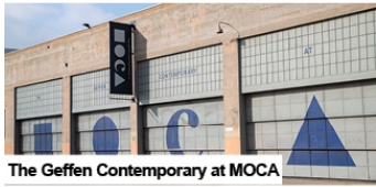
The Geffen Contemporary at MOCA