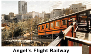
Angel's Flight Railway