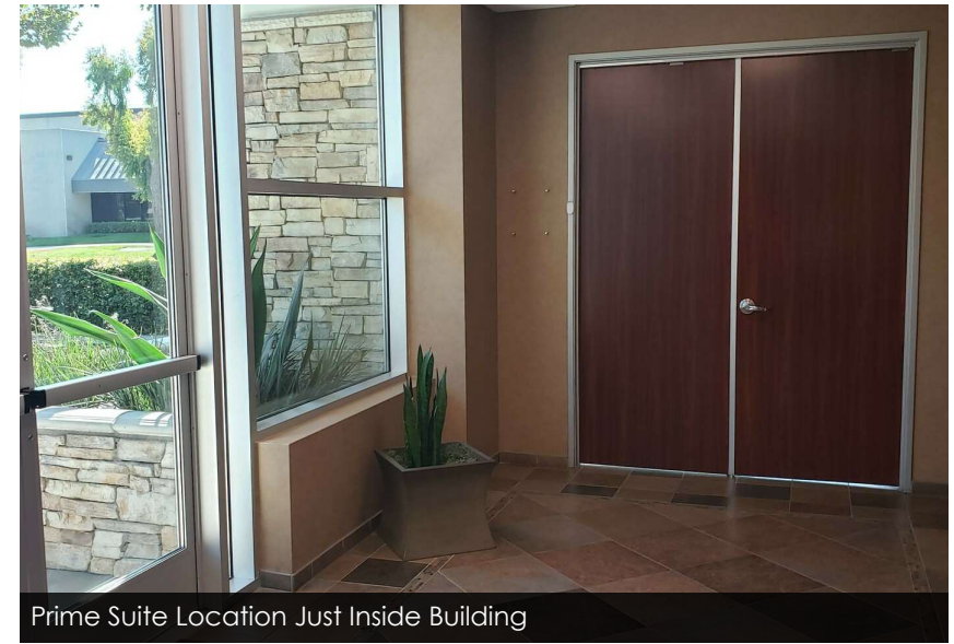
Prime Suite Location Just Inside Building